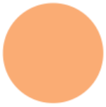
A-1-Areola Light #1