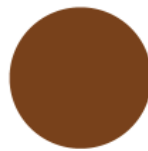
AD-3-Areola Dark #3