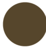
AD-4-Areola Dark #4