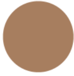
A-6-Areola Light #6