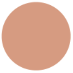
A-2-Areola Light #2